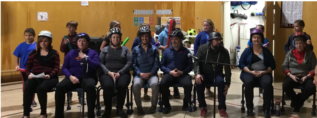
Students perform Boom Whacker Happy Birthday to students who had a birthday in September or October....on staff members helmets! So much fun.