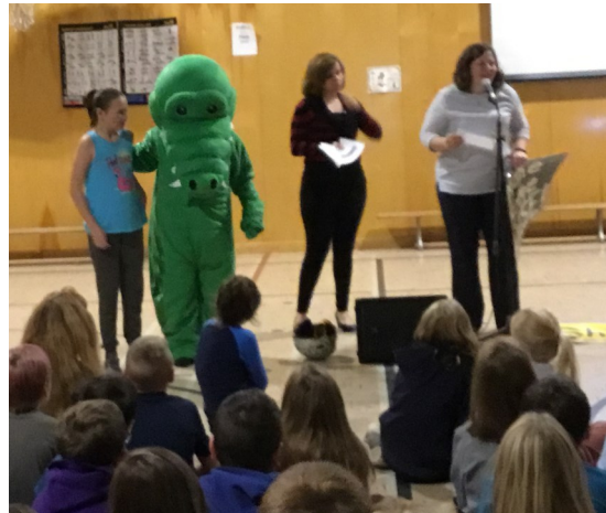
Students congratulated for helping the Saint John community!